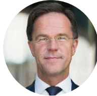
Mark Rutte Prime Minister