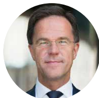
Mark Rutte Prime Minister